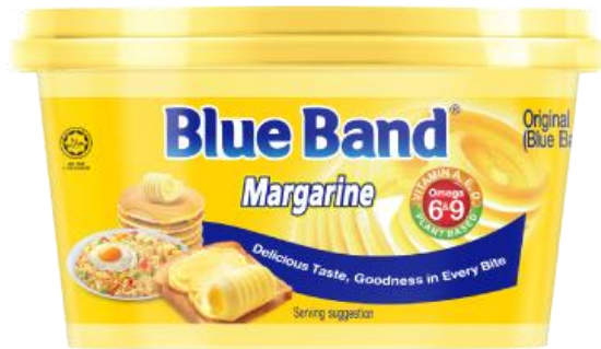
Blue Band Margarine Original