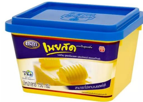
Zest Gold Margarine Fresh Butter Flavour Formula