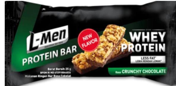
L-Men Whey Protein Bar

Some of the prominent flavour components for plant-based snack bars include beet, spirulina, orange, peanut butter, brownie, and red berry.