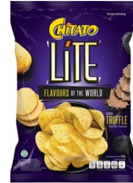
Chitato Lite Truffle

Hence the many variants of snacks with unique new flavours, the result of innovation to attract millennials and Gen Z to.