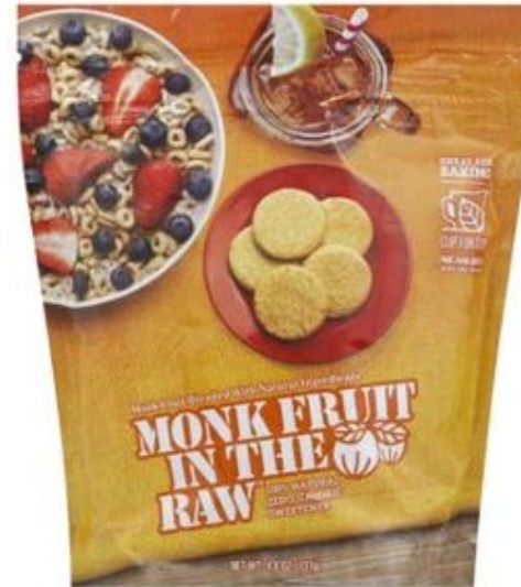
Monk Fruit in the Raw Zero Calorie Sweetener

Natural zero calorie sweetener of Monk fruit blended that can be used to sweeten a tea, a cup of coffee, hot/ cold, mix a cocktail/blend a smoothie. Sprinkle it on cereal or douse a piece of fruit