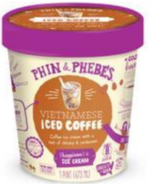
Phin & Phebes Vietnamese Iced Coffee Contains chicory & cardamon