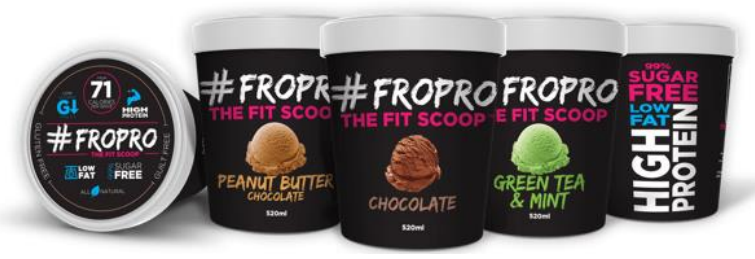
Fro Pro Ice Cream