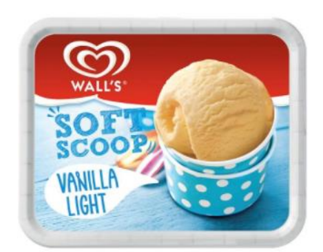
Walls Soft Scoop Light Vanilla Ice Cream