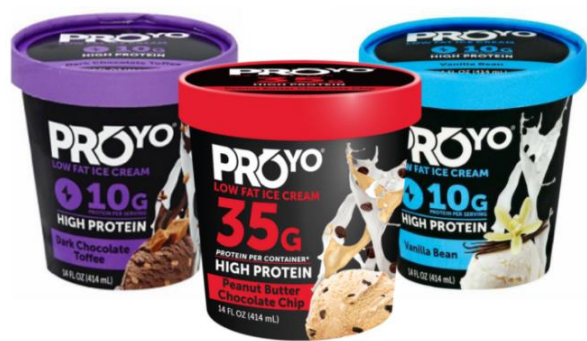
ProYo Low Fat High Protein Ice Cream

Breyers® delights Low Calorie Creamy Chocolate Ice Cream Made with real cocoa