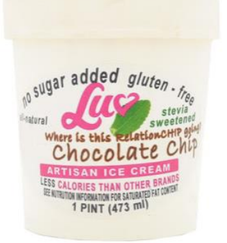
Luv Ice Cream

"Milk flavored yogurt" with pineapple chunks/ Vanilla and yogurt base with prunes and cereal/ Vanilla base with pumpkin and muesli