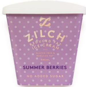
Zilch Ice Cream Contains inulin