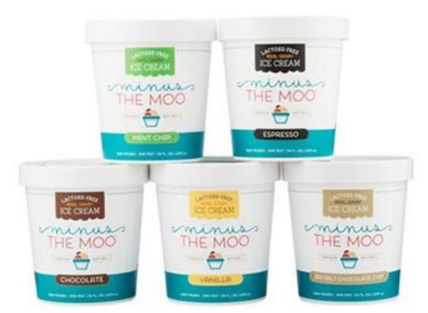
Minus the Moo Lactose Free Ice Cream