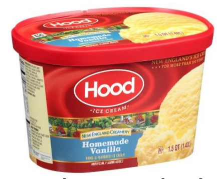
Hood New England Creamery Homemade Vanilla Ice Cream