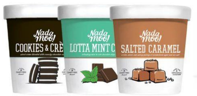
NadaMoo Ice Cream Contains inulin