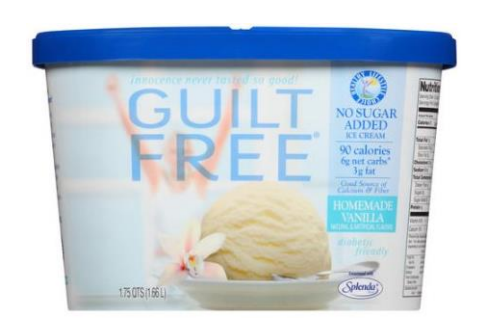
Yarnell's Guilt Free Premium Homemade Vanilla Ice Cream Contains whey protein

Contains Inulin, Xylitol and Whey Protein Concentrate