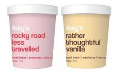
Foxy's Ice Cream Contains Inulin