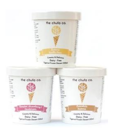
The Chufa Co. Ice Cream Contains Inulin & Pea Protein