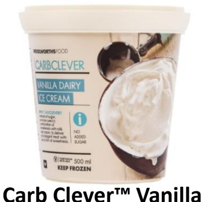
Dairy Ice Cream Contains inulin and Stevia