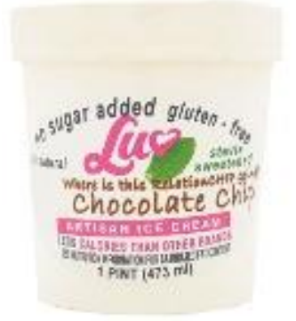
Luv Ice Cream Contains inulin and Stevia