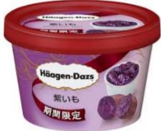
Häagen-Dazs Orange/ Purple Potato Ice Cream