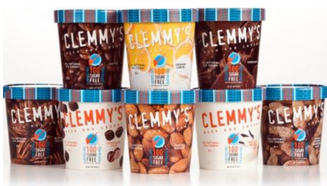
Clemmy's Sugar/Lactose-free ice cream