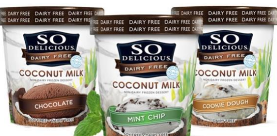
So Delicious Dairy Free Coconut Milk Ice Cream Contains Inulin & Pea Protein