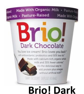
Chocolate Ice Cream Contains inulin &whey protein concentrate