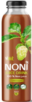
Vinut's Noni Juice Drink