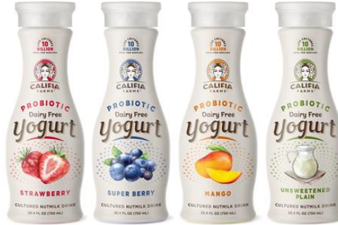
Califia Farms' Dairy Free Yoghurt Drink

Ingredients: Pilsner Laden Water, Beet Sugar, Green Tea, Kombucha Live Culture, Lemon Flavour