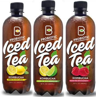
B-tea's Raw Probiotic Iced Tea Kombucha