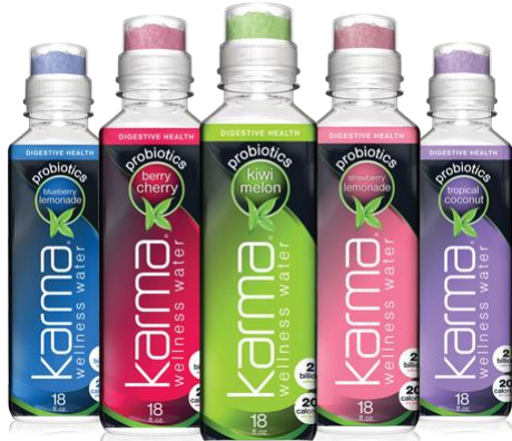
Karma's Probiotics Wellness Water

A creamy and delicious dairy- free almond- and coconut- based yogurt combine with real fruits