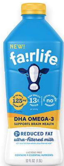
Fairlife® 2% With DHA

13g of protein, 35% daily value of calcium, no added sugar, plus 125mg of DHA Omega-3