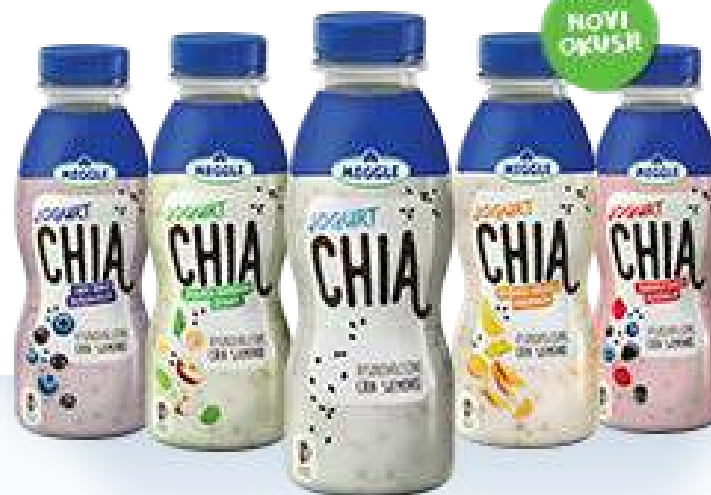
Meggle Yoghurt Chia

Ingredients: Reduced Fat Ultra-Filtered Milk, DHA Omega-3 (Algal Oil) , Lactase Enzyme, Vitamin A Palmitate , Vitamin C (Ascorbic Acid) , Vitamin E (Tocopherols) and Vitamin D3