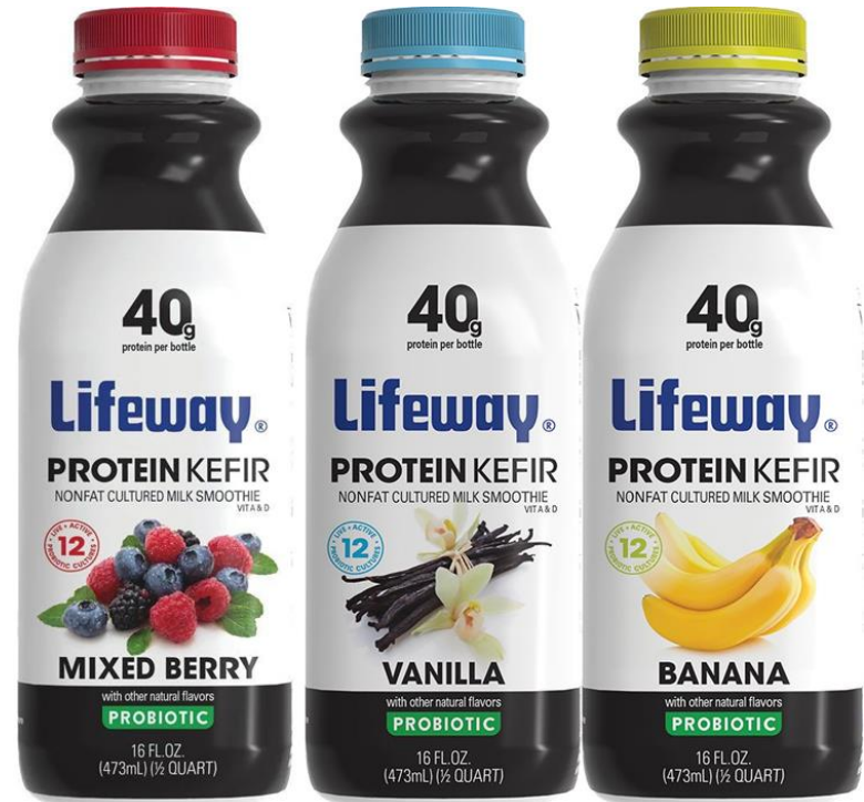
Varieties: Mixed Berry, Vanilla, Banana

Ingredients for Banana Flavour: Pasteurized Cultured Non Fat Milk, Cane Sugar, Whey Protein Concentrate, Pectin , Natural Banana Flavour , Natural Flavours , Vitamin A Palmitate , Vitamin D3 , 12 Probiotic Cultures.