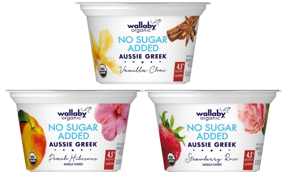
Varieties: Vanilla Chai, Strawberry Rose, Peach Hibiscus

Ingredients for Peach Hibiscus Flavour: Cultured Pasteurised Whole Organic Milk, Organic Peaches, Water, Organic Peaches Puree, Natural Flavour , Pectin , Organic Locust Bean Gum, Organic Lemon Juice Concentrate , Calcium Citrate, Live and Active Cultures: L. acidophilus , L. bulgaricus , S. thermophilus , Bifidus , L. Paracasei .