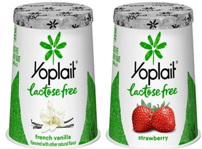
Varieties: French Vanilla, Strawberry