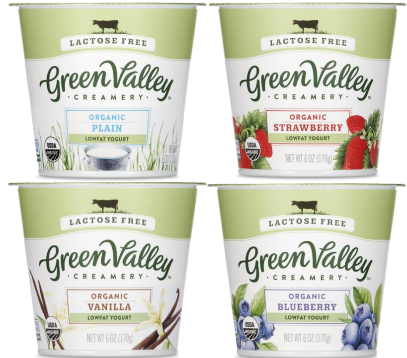
Varieties: Whole Milk (Plain), Low Fat (Strawberry, Vanilla, Blueberry)

Ingredients for Low Fat Plain Flavour: Organic Pasteurised Cultured Low Fat Milk, Lactase Enzyme, Pectin , Live and Active Cultures.