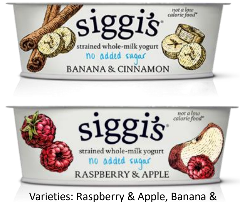
Varieties: Raspberry & Apple, Banana & Cinnamon

Ingredients for Raspberry & Apple Flavour: Pasteurised Whole Milk, Pasteurised Cream, Raspberries, Apples, Fruit Pectin , Live Active Cultures ( S. thermophilus , L. delbrueckii subsp. bulgaricus , B. lactis , L. acidophilus , L. delbrueckii subsp. lactis ).