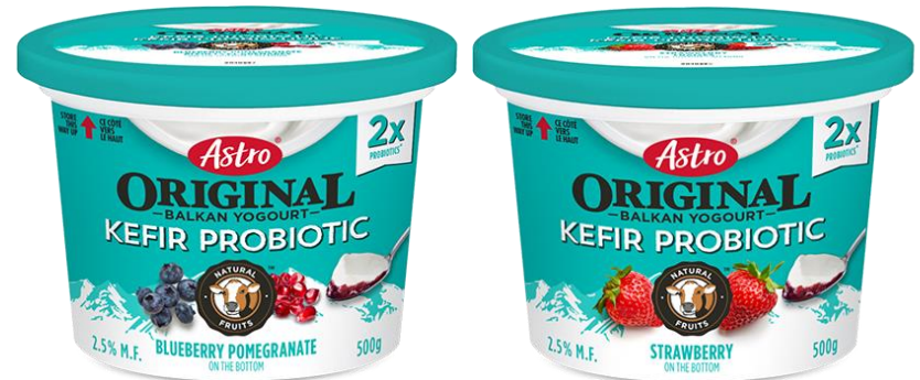
Varieties: Plain, Vanilla, Strawberry, Blueberry Pomegranate

Ingredients for Blueberry Pomegranate: Skim Milk, Cream, Sugar, Water, Blueberries, Skim Milk Powder, Rice Starch, Pomegranate Juice Concentrate , Pectin , Natural Flavour , Carrot Concentrate , Lemon Juice Concentrate , Active Bacterial Cultures.