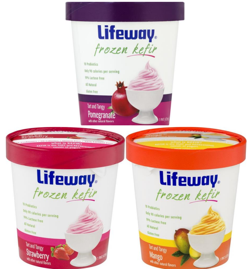
Varieties: Pomegranate, Strawberry, Mango

Ingredients for Pomegranate Flavour: Cultured Low Fat Milk, Evaporated Cane Sugar, Non Fat Dry Milk, Tapioca Maltodextrin , Natural Pomegranate Flavour , Natural Flavours , Stabiliser ( Guar Gum , Carob Bean Gum), Red Beet Juice Concentrate (Colour), Active Kefir Cultures.