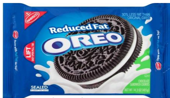
Reduced Fat OREO 30% less fat than original Oreo, 4.5g of fat compared with 7g in original Oreo