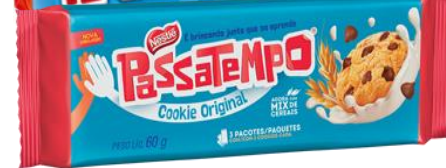
Passatempo Cookie (Strawberry/Chocolate /Original)