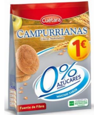
Cuetara Sugar Free Biscuits with Oligofructose and Rice Starch