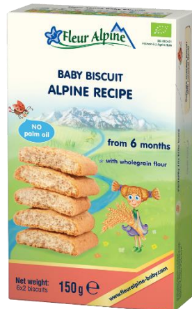
Baby biscuit Alpine Recipe with Inulin