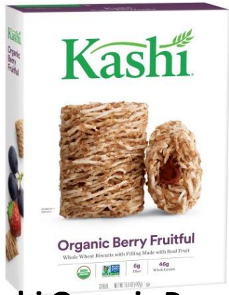
Kashi Organic Promise Cereal, Berry Fruitful Whole Wheat Biscuits With real fruit filling