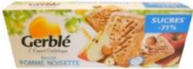
Nutrition & Sante Sugar Reduced Sweet Biscuits with Oligofructose