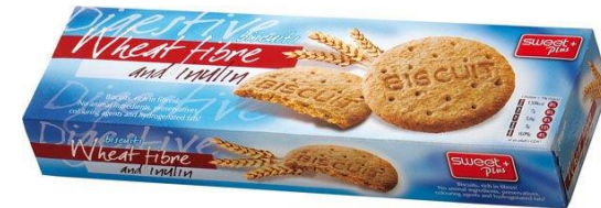
Sweet Plus Digestive biscuits with wheat fibre and inulin