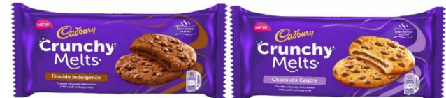
Cadbury Crunchy Melts Biscuits (Soft Cookie Centre/ Double Indulgence/ Chocolate Center)