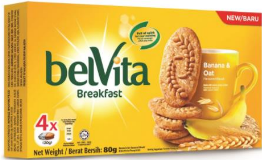
belVita Breakfast Biscuits Banana & Oats