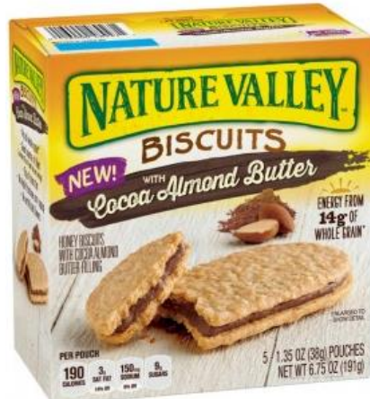
Nature Valley Cocoa Almond Butter Biscuits