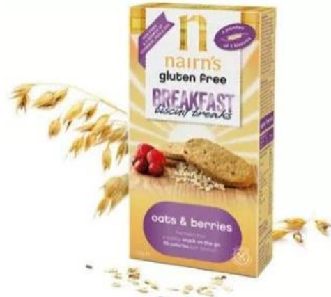
Nairn's Gluten Free Oats & Berries Breakfast Biscuit Breaks