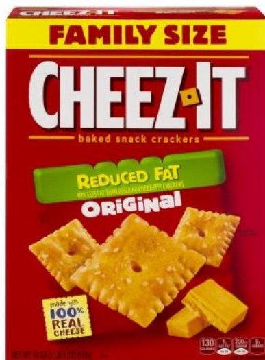
Cheez-It® Reduced Fat Original Baked Snack Crackers