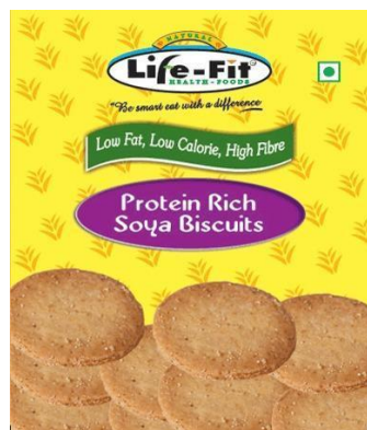
Life-Fit Health Foods' Protein rich soya biscuits Low fat & calories, High in protien & iron