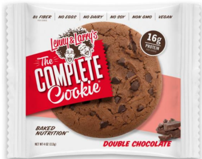
The Complete Cookie (Contains Inulin, Oligofructose, Rice Protein)