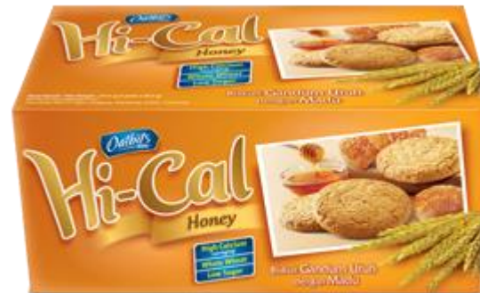
Agel Langgeng Reduced Sugar Biscuits with Isomalt