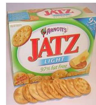
Arnott's Jatz Light 97% Fat Free