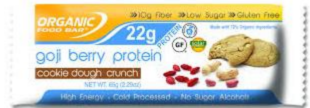
Goji Berry Protein Cookie Dough Crunch Contains whey protein isolate, inulin, goji berries