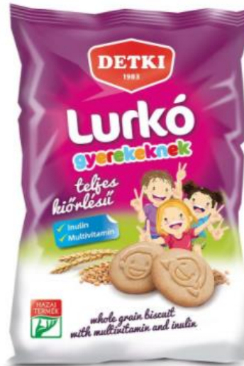
Lurkó Whole-grain Biscuit with multivitamin and inulin