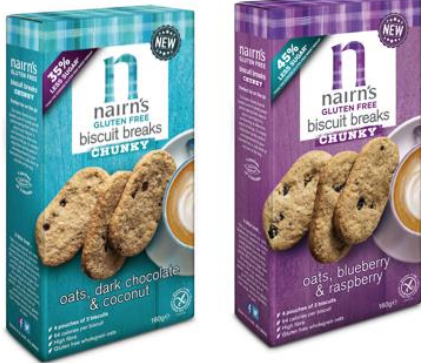
Nairn's Gluten Free Chunky Biscuit Breaks (Oats, Dark Chocolate & Coconut/ Oats, Blueberry & Raspberry)