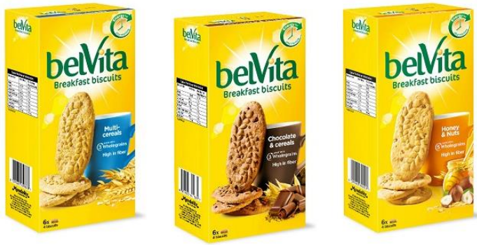
belVita Breakfast Biscuits (Multi-cereals/ Chocolate & Cereals/ Honey & Nuts)