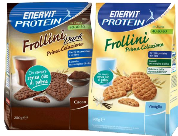
Buff Bake's Protein Cookies Gluten Free, Non-GMO 16g Protein per Cookie