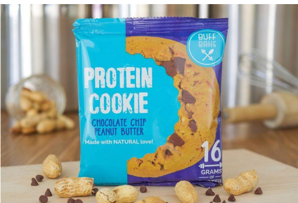
Enervit Protein Biscuits 40-30-30 Breakfast Oat Biscuits