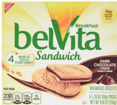
belVita Sandwich Biscuits, Dark Chocolate Contains Oligofructose