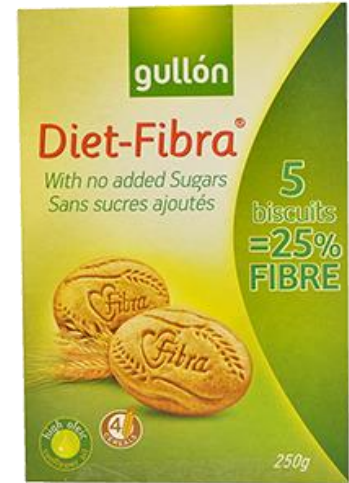
Gullon Diet-Fibra Biscuits with Inulin