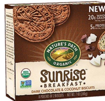
Nature's Path Organic Sunrise Breakfast Blueberry & Chia Biscuits/ Dark Chocolate & Coconut Biscuits