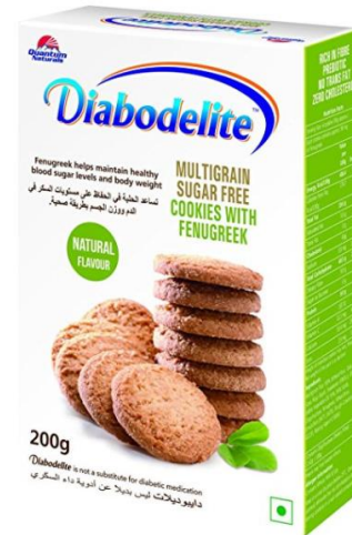
Diabodelite Multi-Grain Sugar Free Cookies Contains Oligofructose