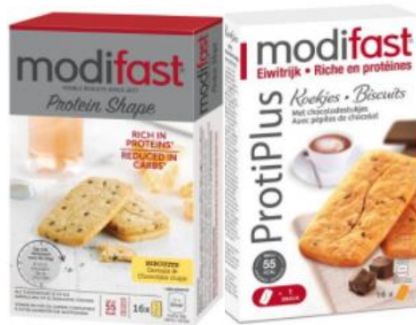
Modifast Protein Biscuits Cereals & Chocolate Chips