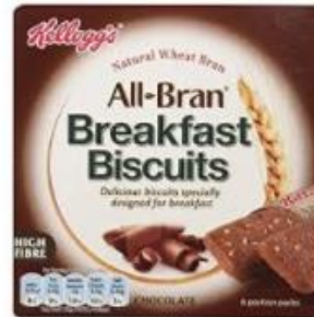
Kellogg's All Bran Breakfast Biscuit (Original/ Chocolate)