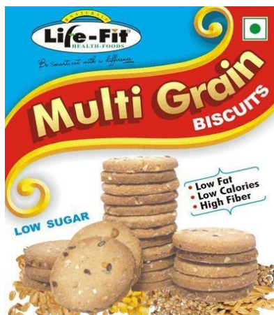
Life-Fit Health Foods' Multi Grain Biscuits Low fat and calories, High in protein & iron