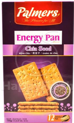
Palmer's Energy Pan Biscuit - Chia Seed Chia Seeds Naturally Contain Omega-3