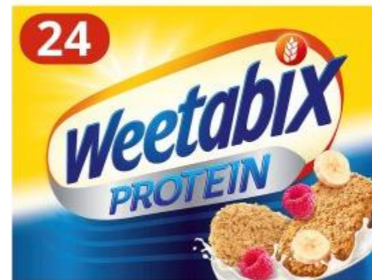
Weetabix's Protein Biscuits Made with wheat protein. High in fibre, Iron & vitamins