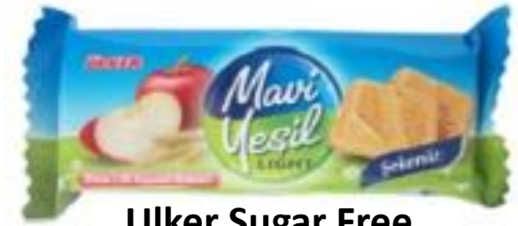
Ulker Sugar Free Biscuits with Inulin