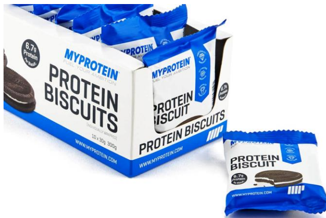
MyProtein's Protein Biscuits Protein-infused chocolate cookie sandwich