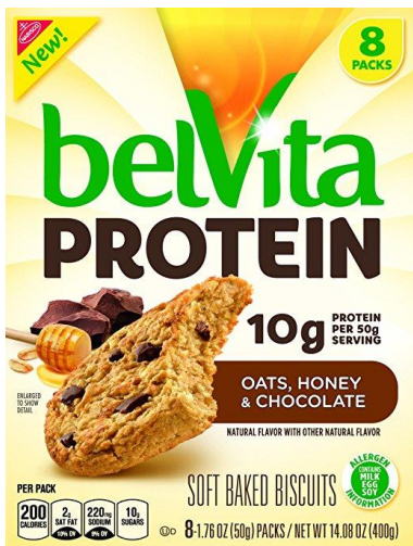
belVita's Protein Soft Baked Biscuits, Oats, Chocolate & Honey 10g of high quality protein per serving