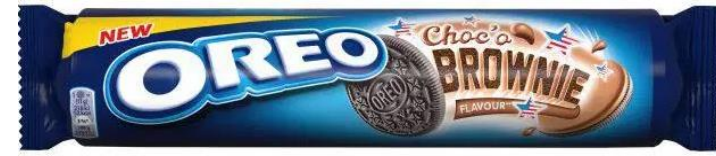
Oreo Choc' O Brownie