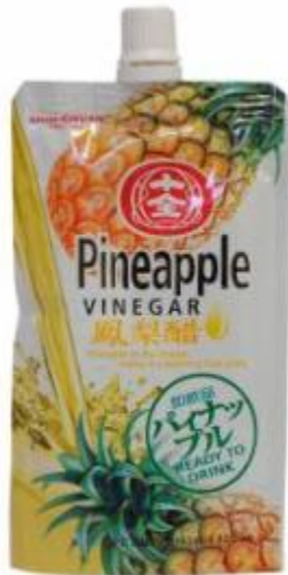
Shih-Chuan's Pineapple Vinegar Drink