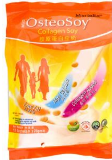
Marinex OsteoSoy Collagen Soy

Ingredients: Soya Bean Extract, Water, Cane Sugar, Collagen (Marine Fish), Flavoring