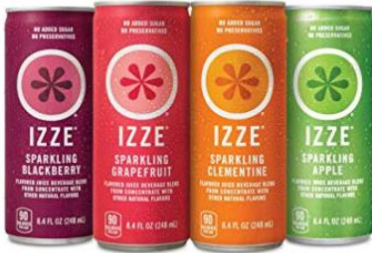
IZZE Sparkling Juice

No added sugar, Contains 70% fruit juice with a splash of sparkling water