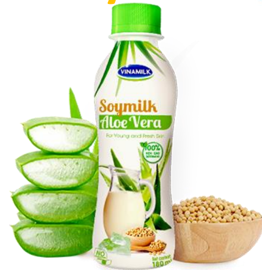
Vinamilk Soymilk Aloe Vera

Ingredients: Organic De-skinned Soya Beans, Spirulina (400mg), Calcium (≈500mg)