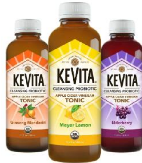
KeVita Cleansing Probiotic Apple Cider Vinegar Tonics

Ingredients: Fermented Vinegar, Fructose And Pineapple Juice