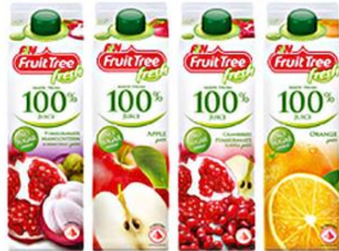
F&N Fruit Tree Fresh 100% Juice

Ingredients: Fruit Juice Blend (Filtered Water, Apple, White Grape, Blackberry, Raspberry and Acerola Juice Concentrate) , Sparkling Water, Citric Acid, Natural Flavor, Red Grape Juice Concentrate ( Color ), Ascorbic Acid (Vitamin C) , Niacinamide , Pyridoxine Hydrochloride (Vitamin B6) .