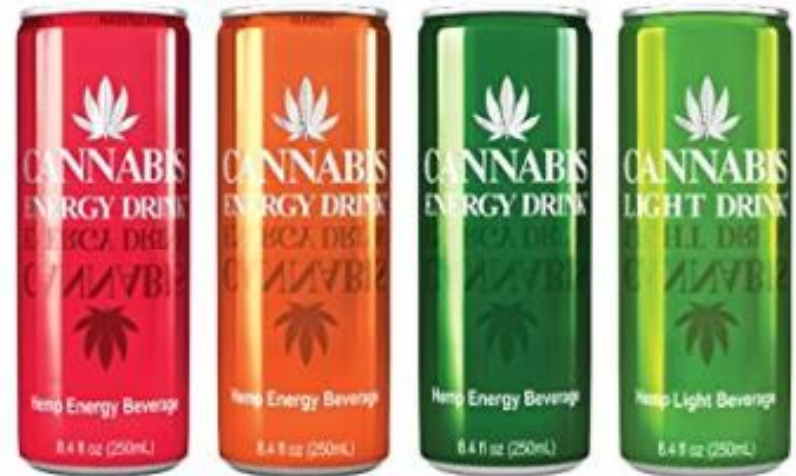
Cannabis Energy Drink

Ingredients: Potassium Bicarbonate , Calcium Chloride , Magnesium Chloride , Anhydrous Hemp Oil)