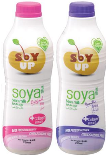
Soy Up + Collagen

Contains 500mg of premium marine collagen in each serving